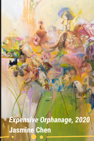
Expensive Orphanage, 2020 Jasmine Chen