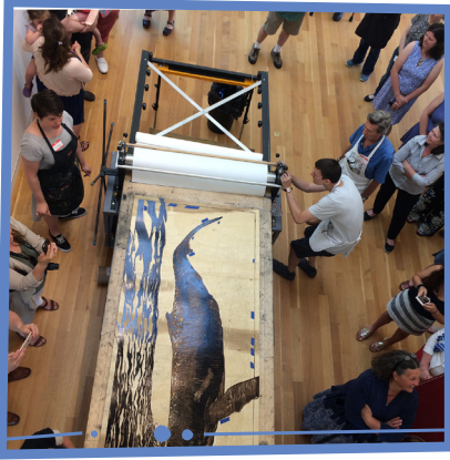
Big Ink for Big Hearts